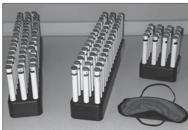
Figure 1. The Sniffin' Sticks.

a Grading scores are as follows: 0 indicates no edema; 1 to 3, mucosal edema (mild/moderate/severe); 4 to 6, polypoid edema (mild/moderate/severe); and 7 to 9, frank polyps (mild/moderate/severe).